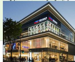
Nagoya ZERO GATE's lighting display